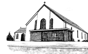
St. Brigid's Church,