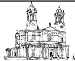
Ss. Peter & Paul's Church,

are issued from the Sacristy (090 64 94 150)