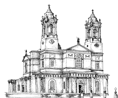
Ss. Peter & Paul's Church, Athlone

Baptism, Confirmation & Marriage Certificates are issued from the Sacristy