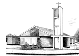
Church of Our Lady of the Wayside, Clonown

To Contact the Priest on Duty Call 0858705804