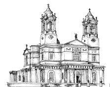
Ss. Peter & Paul's Church, Athlone