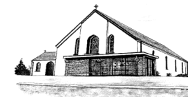
St. Brigid's Church, Drum