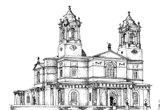
Ss. Peter & Paul's Church, Athlone