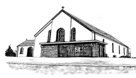
St. Brigid's Church, Drum