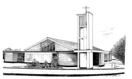
Church of Our Lady of the Wayside, Clonown