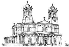
Ss. Peter & Paul's Church, Athlone