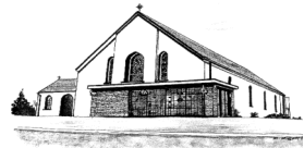
St. Brigid's Church, Drum