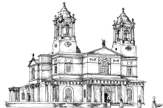
Ss. Peter & Paul's Church, Athlone