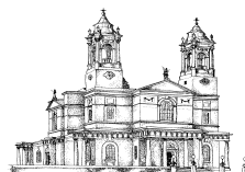
Ss. Peter & Paul's Church, Athlone

Baptism, Confirmation & Marriage Certificates are issued from the Sacristy