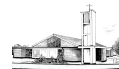
Church of Our Lady of the Wayside, Clonown