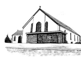
St. Brigid's Church, Drum