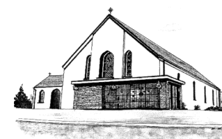
St. Brigid's Church, Drum