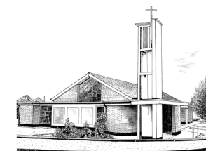
Church of Our Lady of the Wayside, Clonown