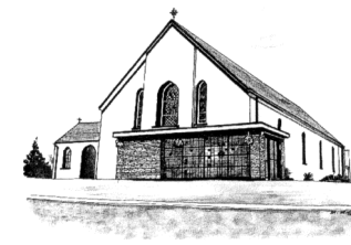
St. Brigid's Church, Drum