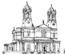
Ss. Peter & Paul's Church, Athlone

sspeterparish@eircom.net www.sspeterandpaulsparishathlone.com Facebook.com/Sspeterandpaulsparish Twitter ; @stpetersathlone