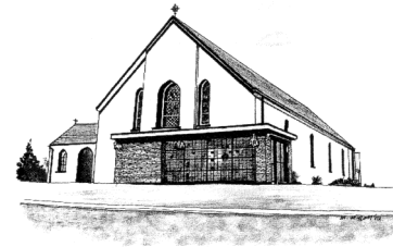
St. Brigid's Church, Drum E-mail drumparish1@gmail.com www.drum.ie