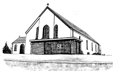
St. Brigid's Church, Drum E-mail drumparish1@gmail.com www.drum.ie