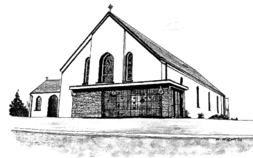
St. Brigid's Church, Drum E-mail drumparish1@gmail.com www.drum.ie