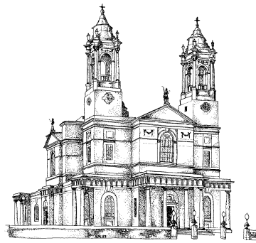
Ss. Peter & Paul's Church, Athlone E-mail sspeterparish@eir.net

OFFERTORY COLLECTION: Sunday, 5th June..... €1820