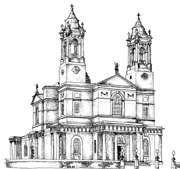
Ss. Peter & Paul's Church, Athlone E-mail sspeterparish@eir.net

OFFERTORY COLLECTION: Sunday, 8th May..... €1,705