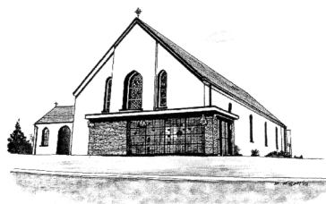
St. Brigid's Church, Drum E-mail drumparish1@gmail.com www.drum.ie