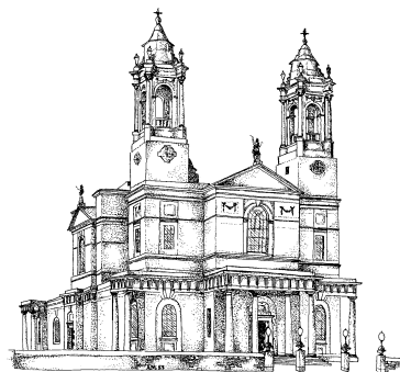
Ss. Peter & Paul's Church, Athlone E-mail sspeterparish@eir.net

OFFERTORY COLLECTION: Sunday, 13th March..... € 2,050.00