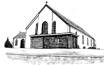
St. Brigid's Church, Drum E-mail drumparish1@gmail.com www.drum.ie