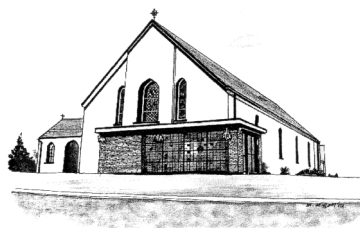
St. Brigid's Church, Drum E-mail drumparish1@gmail.com www.drum.ie