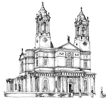
Ss. Peter & Paul's Church, Athlone E-mail sspeterparish@eir.net

OFFERTORY COLLECTION: Sunday, 25th October..... € 1555.00 MAINTENANCE COLLECTION: ..... € 555.00