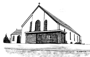
St. Brigid's Church, Drum E-mail drumparish1@gmail.com www.drum.ie