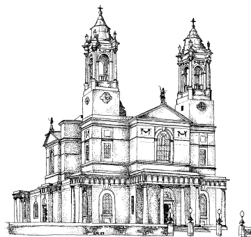
Ss. Peter & Paul's Church, Athlone E-mail sspeterparish@eircom.net

OFFERTORY COLLECTION: Sunday, Sept. 13th ..... € 1834.00 MAINTENANCE COLLECTION: ..... € 665.00