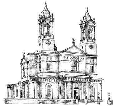
Ss. Peter & Paul's Church, Athlone E-mail sspeterparish@eircom.net

OFFERTORY COLLECTION: Sunday, August 16th ..... €1785.00 MAINTENANCE COLLECTION: ..... € 566.00 HOLYDAY - 15th August .....€ 990.00