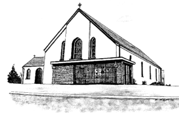
St. Brigid's Church, Drum E-mail drumparish1@gmail.com www.drum.ie